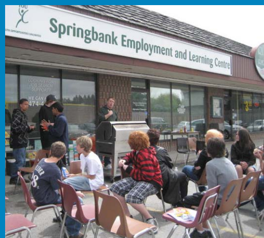
Annual Career Carnival at Springbank

360 Springbank Drive, Unit 7, London, Ontario t: 519.474-4946 ALL SERVICES ARE FREE