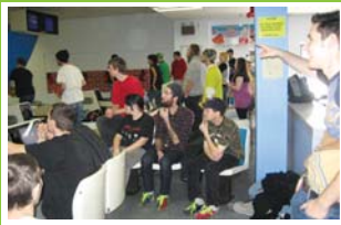
Recreations Program's Bowling Night

The Recreation Program provides youth with opportunities to take part in positive and healthy activities. Recreation and physical activity are an important part of development. They contribute to a healthy lifestyle. At YOU we help eliminate the barriers that may stand between you and these opportunities. To date the Recreation Program has run events such as canoeing, bowling, kickboxing, and YMCA gym memberships. All have been very successful. There are other events in the works.