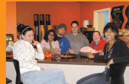
Staff of the Next Wave Youth Centre

The Next Wave Youth Centre has re-opened as of December 1, 2008. We are very excited to be open and have resumed programming and activities. The Centre is available for youth to access job search support. There are MANY resources to check out and an Employment Counselor is also available to provide support during Centre hours. The Centre will be offering workshops throughout 2009 including resumé writing and interviewing. There are staff